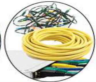
No Hoses, Wires, or Hangers

Check SWANCC's Recycling Directory for outlets for some of these materials.