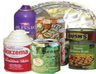
Metal Steel & Aluminum Containers and Foil