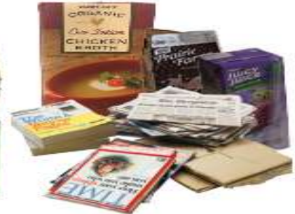
Paper, Cartons, & Cardboard Office, Newspaper, Magazines, & Cardboard (Flatten)

Verify details with your community's recycler!