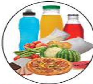
No Food, Liquids, Diapers, or Shredded Paper