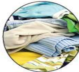
No Clothing or Shoes