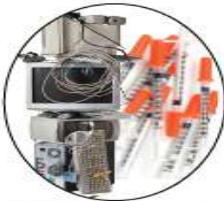
No Electronics or Sharps