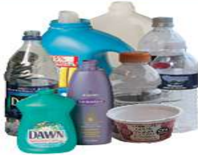
Plastic Containers Bottles, Tubs, Jugs and Jars - Re-cap lids! (No #6 PS)

Materials go in cart LOOSE! Empty, Rinse, & Clean!