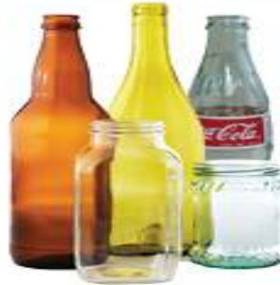
Glass Containers Bottles & Jars