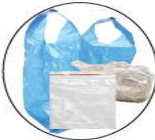
No Plastic Bags or Wrap